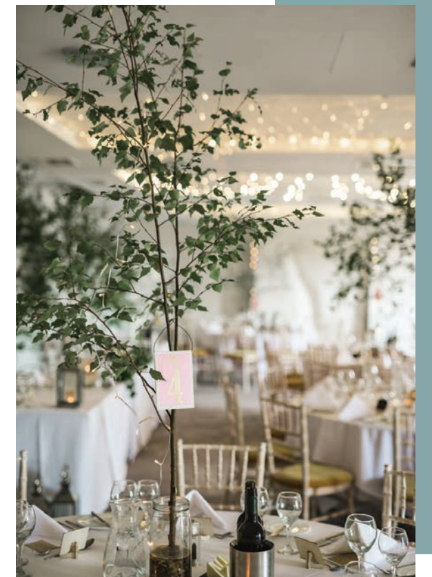
A country house retreat on the Hampshire & Berkshire borders

The manor house at Highfield Park is a stunning backdrop for any special occasion. From christenings to birthday parties, school proms to gender reveals we have a number of suites suitable for gatherings from 2 to 200 guests. We understand that every occasion is personal and with so many different options, it can be a daunting task to begin planning. That's why our team are experts in planning and can give recommendations and advice based on previous events if you don't know where to start or if you already know what you are looking for; they can help turn that vision into reality.