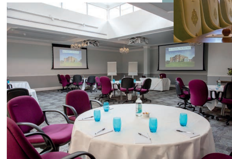
A country house retreat on the Hampshire & Berkshire borders